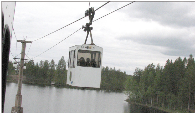
The cableway at Örträsk.