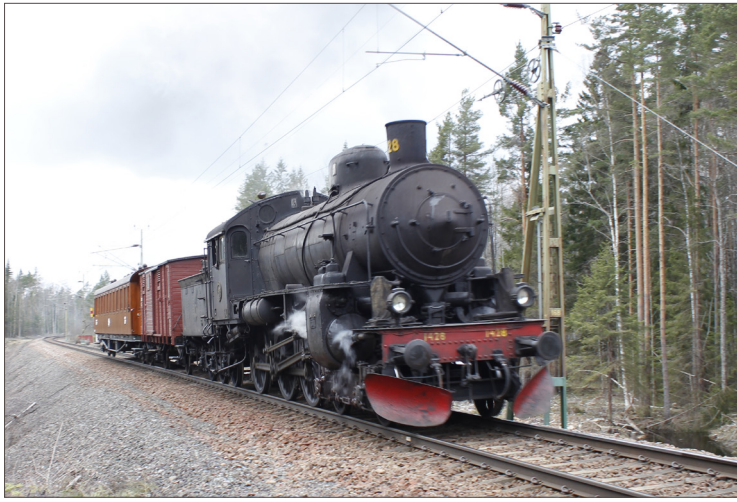
SJ B 1428, one of the two steam locomotives which will haul the train on both journeys.